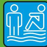
public swimming-pool & sauna