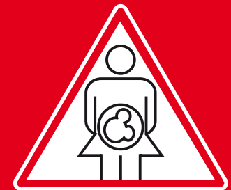
mother to child (at birth, breastfeeding)