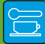
eating & drinking together