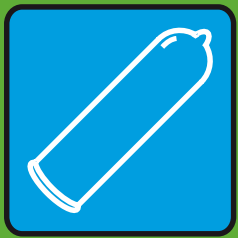
sex with condoms