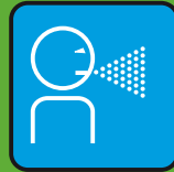
coughing at & sneezing on somebody