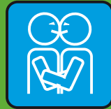
kissing & embracing