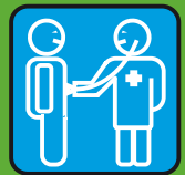
doctor & nursing